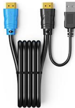
HDMI吊头线1.5m*8 HDMI吊头线1.8m*4 HDMI吊头线2.5m*4